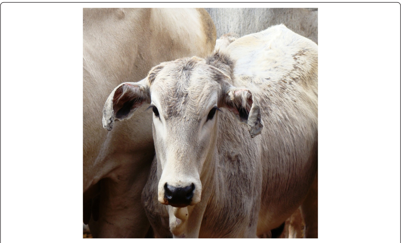
Figure 4 Cicatricial retraction of the ear, popularly known in Brazil as "cartridge-shaped ears" (calf).

Prophylactic measures include keeping the animals away from areas with a history of bee accidents or pastures where there are beehives in trees or termite mounds; alternatively, beehives can be removed with the help of a beekeeper. It is recommended that inactive termite mounds be removed from grazing areas when possible