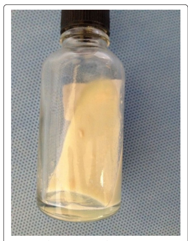
Figure 3 Mycobacterium marinum culture on Löwenstein-Jensen medium, after 12 days of incubation at 26°C (78.800°F).

Diagnosis of this infection is suspected mainly by clinical history, occupational backgrounds and lifestyle habits. Although histopathology is important in the differential diagnosis, the confirmation is performed through culture on Löwenstein-Jensen medium [1,8]. Emerging studies have demonstrated that PCR can become a fast, sensitive and specific diagnostic tool, concerning a more comprehensive method. However, it should be interpreted with caution, as false-positives are possible [7,9]. The PRA-hsp65 is a rapid and highly reliable method in the identification of nontuberculous mycobacteria. In this molecular method, a fragment of the hsp65 gene is amplified by PCR and then